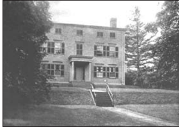
Gerrish-Hill House (1799) 61 High Street