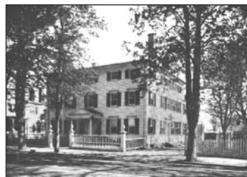
Hale-Kingman House (1800) 348 High Street