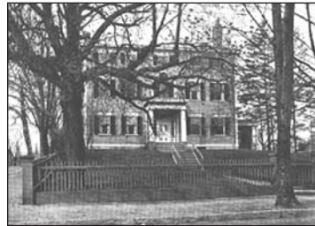
Livermore-Lunt-Barron House (1805) 79 High Street