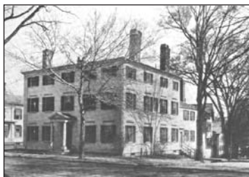
Adams-Toppin House (c.1808) 148-150 High Street