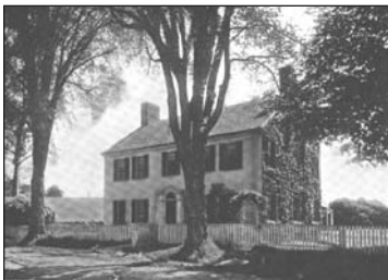
Edward Toppan House (c. 1819) 31 Toppans Lane