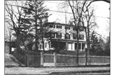
Stocker-Wheelwright House (c.1797) 75 High Street