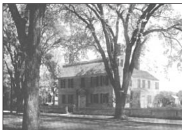
Thomas Coker House (c.1795) 266 High Street