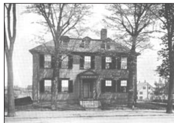
Pettingell-Fowler House (1792) 180 High Street