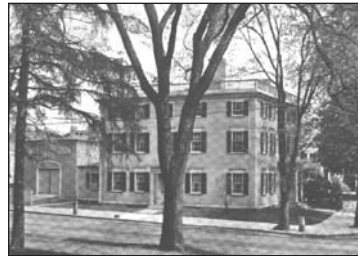
Davenport-Greeley House (c.1808) 78 High Street