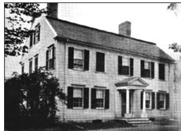
Wyman House (1790s) 8 Orange Street