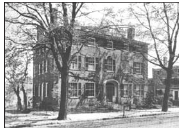
Cushing House (c. 1808) 98 High Street