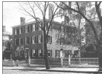
Titcomb-Raymond House (1808) 105 State Street