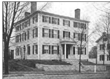
Bass-Whitney House (1807) 26 Tyng Street