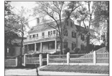
Greenleaf-Wood House (1799) 87 High Street