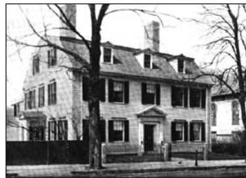
Bradbury House (c. 1786) 28 Green Street