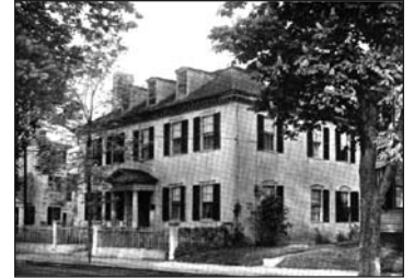
Nicholas Johnson House (c. 1793) 43 Federal Street