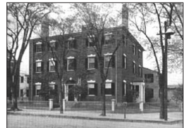
Wourt-Stone House (c. 1805) 132 State Street