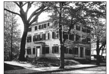
Clark-Currier House (1803) 43 Green Street