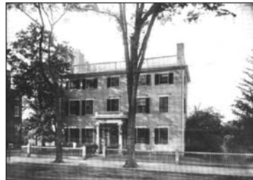
Nelson-Wheelwright House (1801) 96 High Street