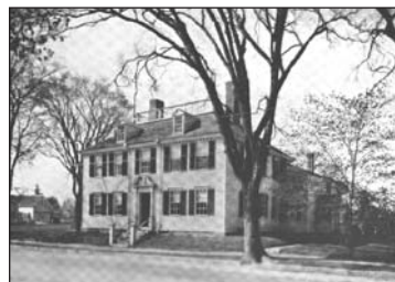
Miltimore-Husk House (1809) 281 High Street