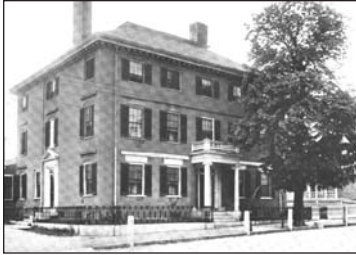
William Bartlett House (1798) 15-17 Federal Street