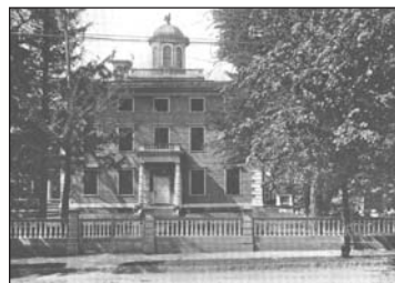
Jackson-Dexter House (1771) 201 High Street