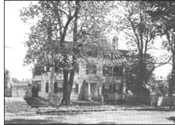
Swett-Storey House (1800) 68 High Street