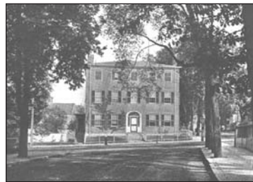
Dodge-Kiley House (1811) 39 Green Street