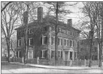
Babson-Bartlett House (c.1782) 32 Green Street