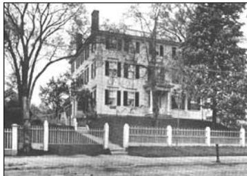
Joseph Moulton House (1810) 89-91 High Street