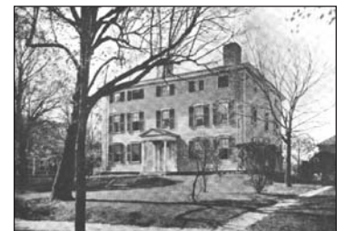
Lowell-Tracy-Johnson House (1774) 203 High Street