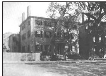
Carter-Tilton House (1800) 100 State Street