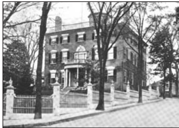
Wheelwright-Richardson House (c. 1806) 77 High Street