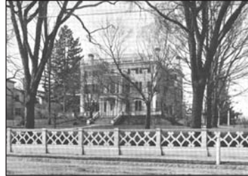
Pike-Cushing-Bachman House (c. 1810) 63 High Street