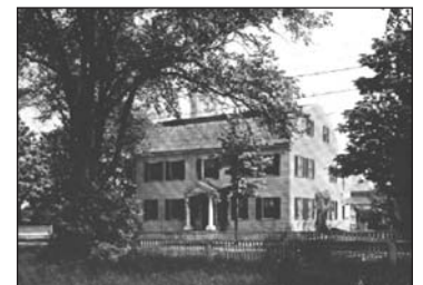
Josiah Little House (c. 1780) 350 High Street