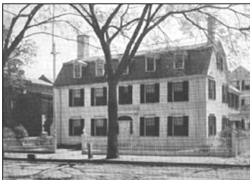
Dalton House (c. 1746-1747) 95 State Street