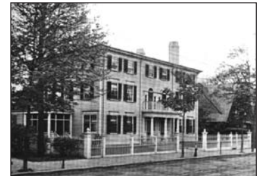
Tenney-Noyes House (1807) 102-104 High Street