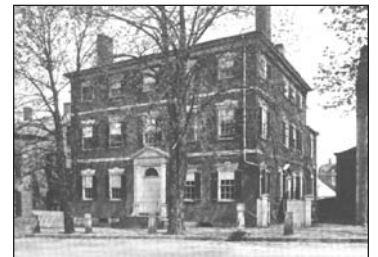
Bartlett-Atkinson House (1804) 3 Market Street