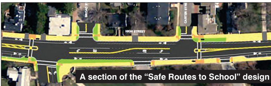
A section of the "Safe Routes to School" design

At issue is the building department not following the process of public notice and hearing before the zoning board of appeals. This is the third "demolition-by-skirting-procedure" since pro-preservation zoning laws were passed unanimously in 2013. ■