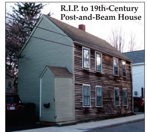
R.I.P. to 19th-Century Post-and-Beam House