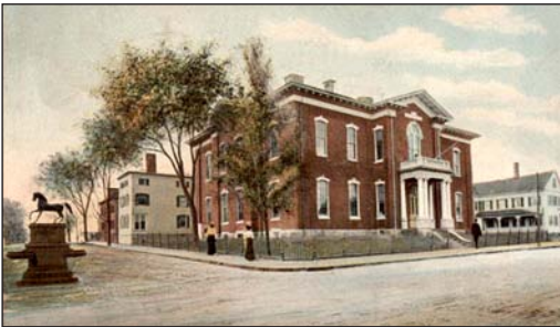
Kelley School (1872), High Street. Closed in 2007 after 135 years as a public school. Now the home of the Newburyport Youth Center.