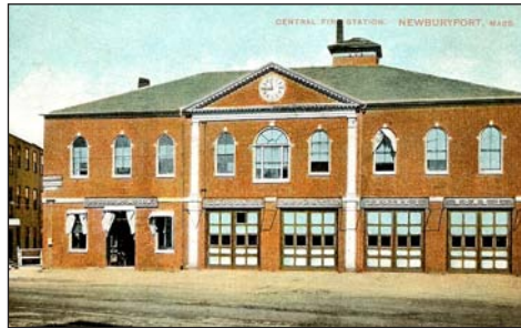
Firehouse (1823), Market Sq. Originally a market building, it was the central firehouse 1864-1980. Theatre & restaurant since 1990.