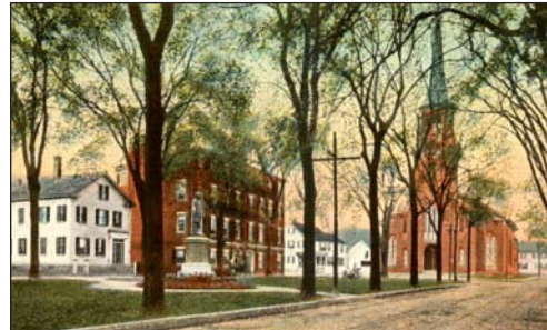
Brown Square , Pleasant, Green, Titcomb Sts. (1802). Central Cong. Church (1861), Brown Sq. Hotel (1809), W.L. Garrison statue (1893).