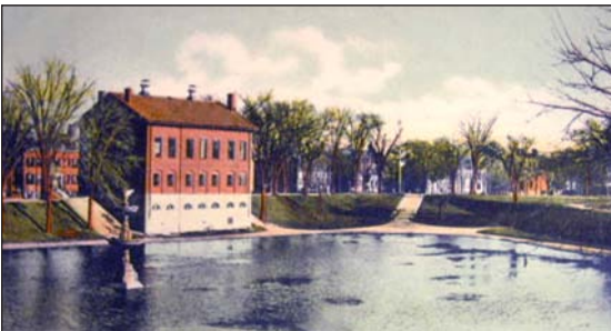
Essex County Superior Courthouse (1805), 145 High Street at Bartlett Mall. Improvements to this area, originally a watering hole for cattle, began in 1744.