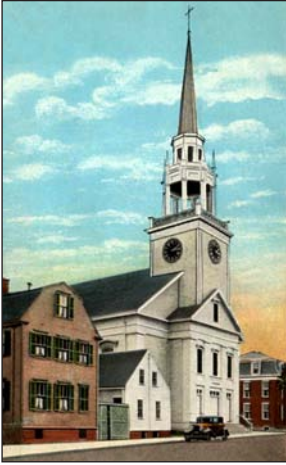
Old South Church (1756) 29 Federal Street

Compiled by R.W. Bacon for the Newburyport Preservation Trust (2012)