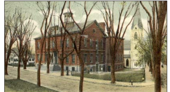
Putnam Free School (1848), High & Green Sts. Served as Newburyport's high school until 1937. Destroyed by fire in 1945.