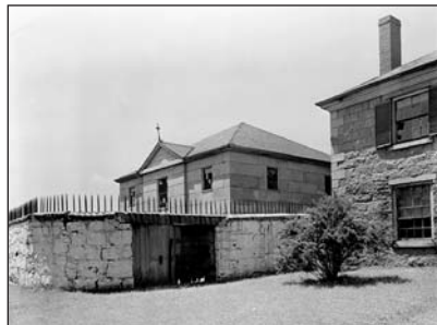
"The Old Gaol" (1824), 10 Auburn St. The county jail until 1918, it was sold to private owners in 1923.