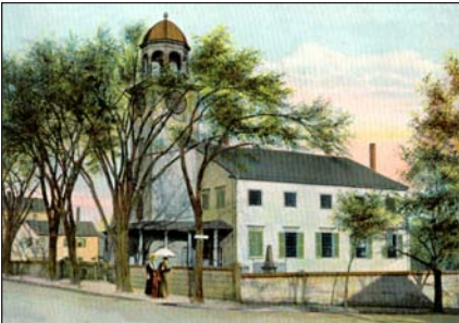
St. Paul's Church (1801, burned in 1920), 166 High Street. The stone church now on the site was completed in 1923.