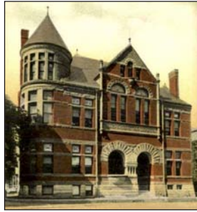
Newburyport YMCA (1891; razed 1991 after 1987 fire) 96 State Street