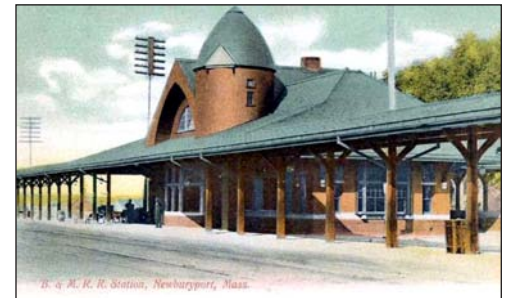
Boston & Maine Railroad Station (1893), Winter St. The depot built in 1854 was destroyed by fire in 1892. This depot burned in 1968.